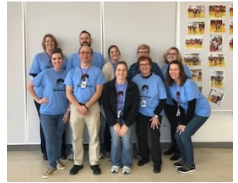
Whiteside Middle School teachers wear blue, choose kind shirts Inspired by the book Wonder.